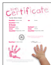
HANDPRINT PINK (FOUR OPTIONS)