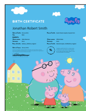
PEPPA PIG FAMILY