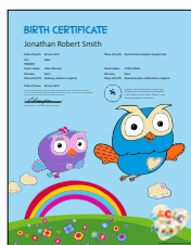
GIGGLE & HOOT RAINBOW