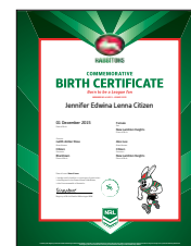
NRL - CLUB OR STATE OF ORIGIN

Capture the joy of a new birth, or celebrate a birth from many years ago with a commemorative birth certificate. You can choose a standard birth certificate only, a commemorative only, or both together.