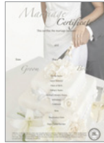
Cut the Cake

With each order for a commemorative marriage certificate package, you will receive a standard marriage certificate. Commemorative marriage certificates do not contain security features and organisations may not accept them as a proof of identity document. See separate Fees for Products and Services flyer.