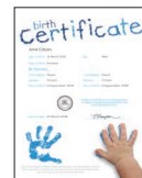
HANDPRINT BLUE 2