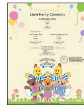
BANANAS IN PYJAMAS 2