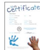
HANDPRINT BLUE 3