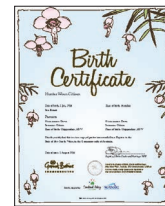
MAY GIBBS' BORONIA BABIES