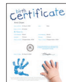
HANDPRINT BLUE 1

Indicate your selection (1,2,3 or 4) on the order form, e.g. 'Handprint Pink 3'. Designs below are also available in Handprint Pink.