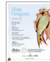
MAY GIBBS' GUMNUT BABIES