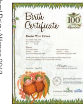
MAY GIBBS' SNUGGLEPOT & CUDDLEPIE