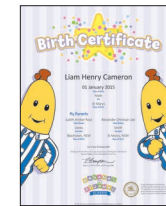
BANANAS IN PYJAMAS 1