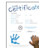
HANDPRINT BLUE 4

All Commemorative birth certificates come in a popular framing size (279mm x 355mm) and are mailed separately to the standard certificate (A4 size).